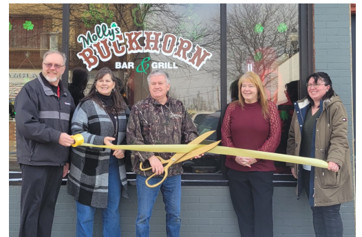
Every new member business receives a welcome and ribbon-cutting, usually featured in the local newspaper.

Check us out on Discover WI TV! We distribute information on upcoming events to TV stations, radio stations, newspapers, Chamber of Commerce offices in other cities, the Green Lake County Visitors Bureau, and local officials. We also work with specialty publications, including the Fox Cities Magazine and "Worth the Drive."