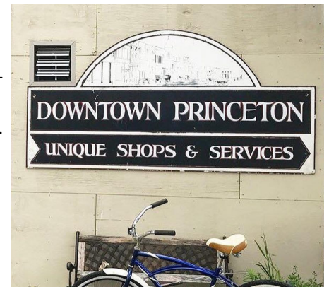
Billboards, street signs, and murals direct visitors to Princeton businesses.